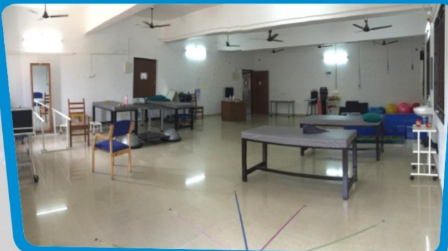
Neuro Physiotherapy Department